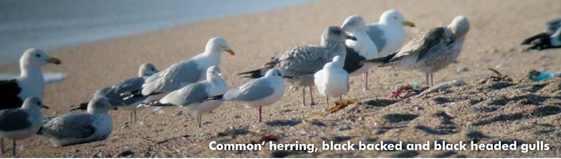
Common, herring, black backed and black headed gulls